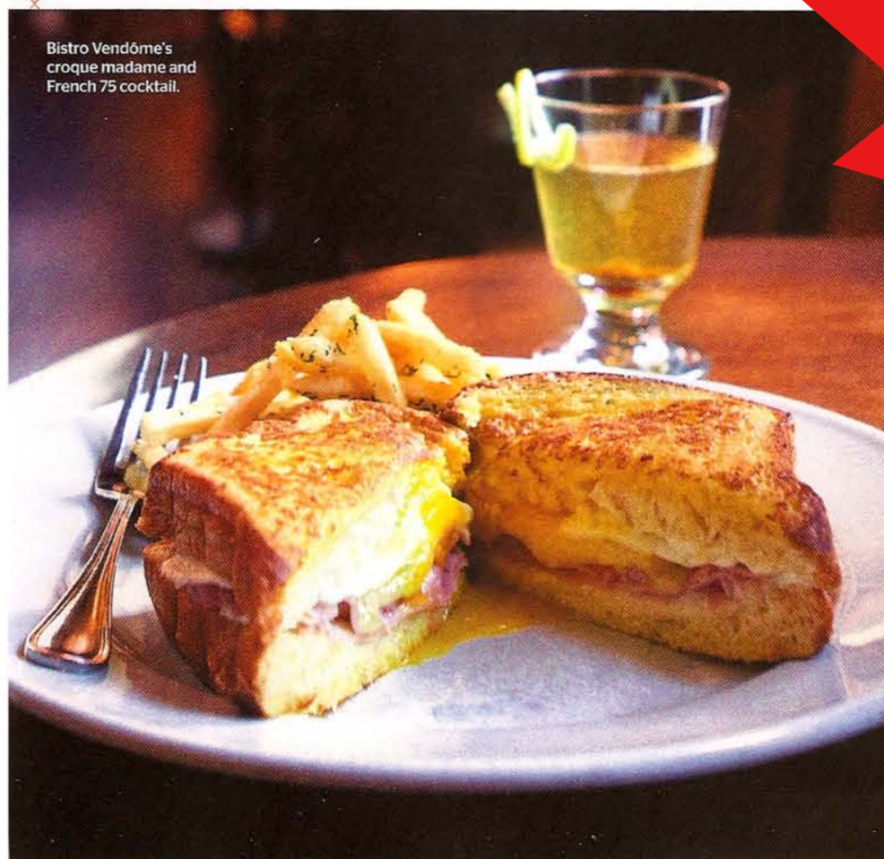
Bistro Vendôme's croque madame and French 75 cocktail.

Denver is about 4,000 miles away from Ireland, but you can forget the distance during weekend brunch at Casey's Bistro and Pub in Stapleton. We dare you to finish their Authentic Irish Breakfast plate of two eggs, rashers (thick slices of Irish bacon), bangers (pork sausages), black and white pudding (more sausage), sautéed mushrooms, roasted tomatoes, and Irish brown bread. 7301 E. 29th Ave., 720-974-7350, caseysbistroandpub.com